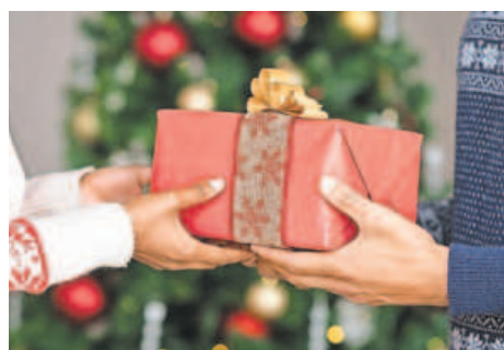
Many Americans dread the prospect of picking out presents for their colleagues. REVIEWED.COM

Don't buy gifts that can be deemed too intimate. Anything worn close to the body, from clothes to perfume, should be avoided, along with in-